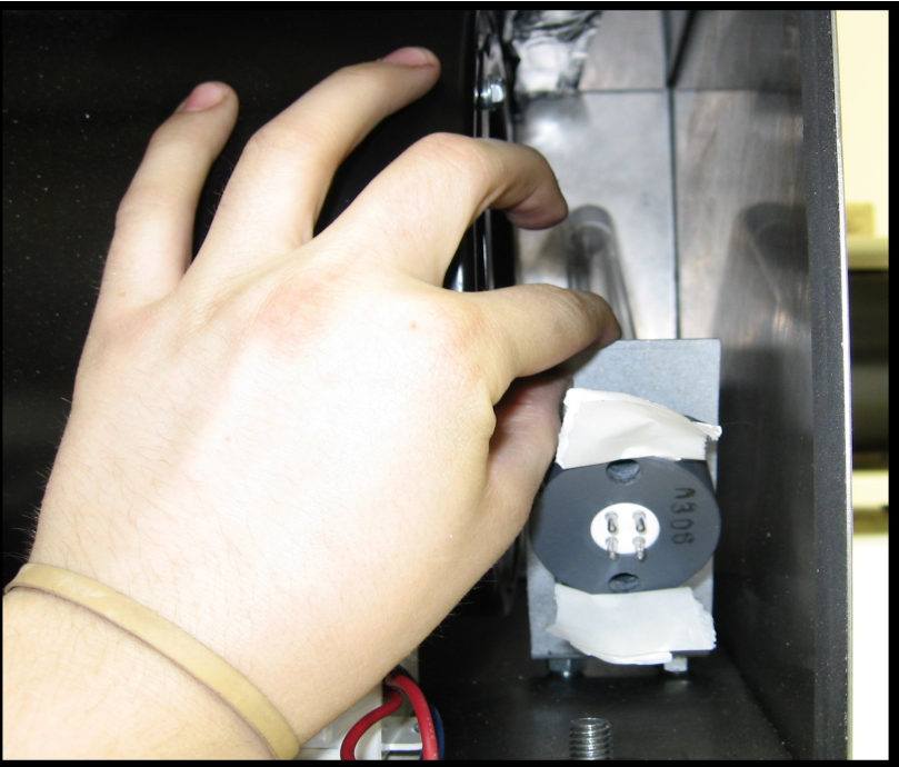
THE UV BULB/BRACKET SHOULD BE POINTING AWAY FROM YOU AS YOU ARE PUTTING IT IN.