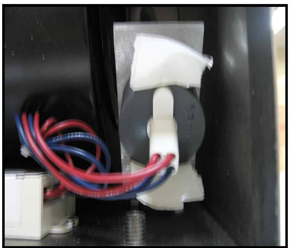
TAKE THE WIRING HARNESS AND PLUG IT INTO THE END OF THE UV BULB.