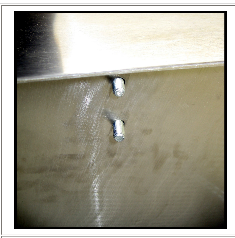
TAKE THE UNIT AND TIP IT TO THE LEFT SO THAT YOU CAN FIND WHERE THE TWO (2) BOLTS ARE STICKING OUT.