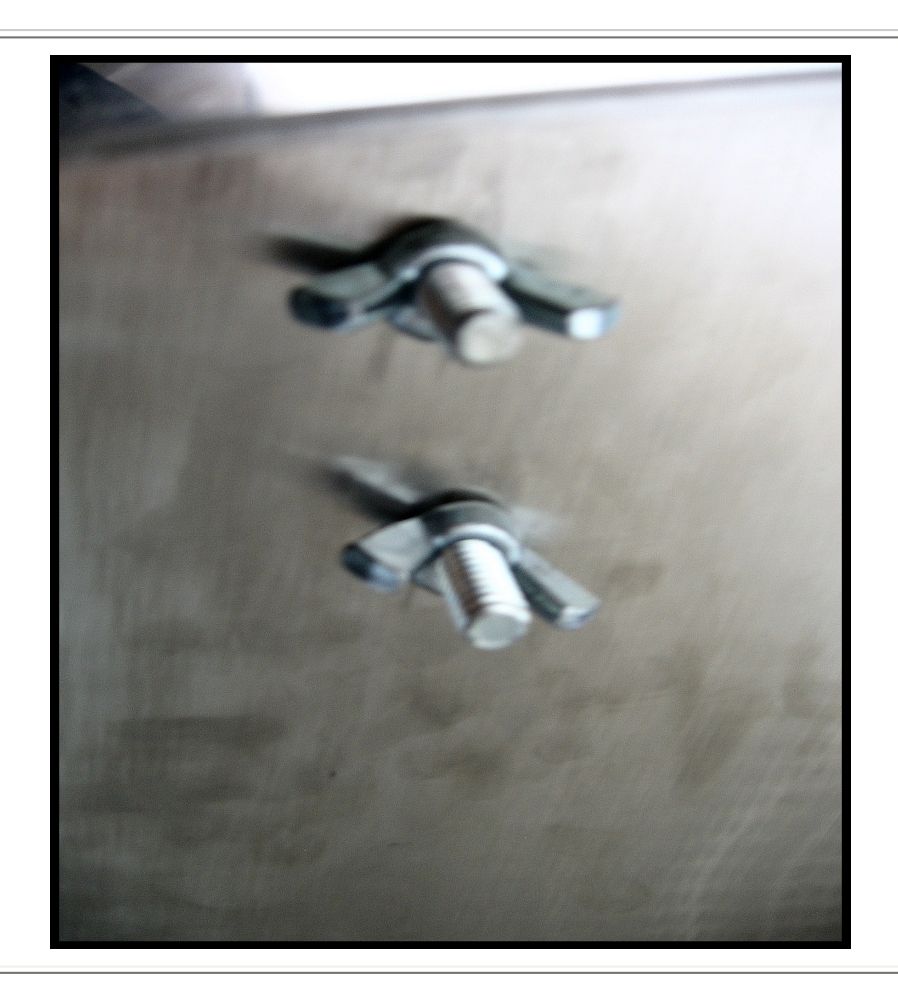
THEN, YOU WILL TIGHTEN THE TWO (2) WINGNUTS ONTO THE BOLTS.